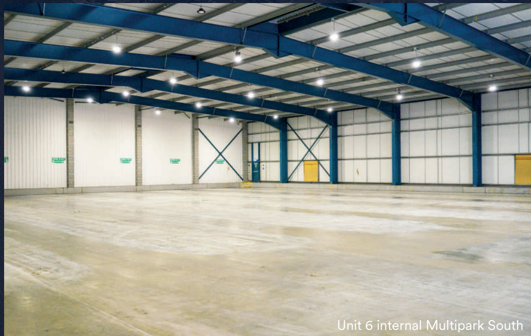
Unit 6 internal Multipark South