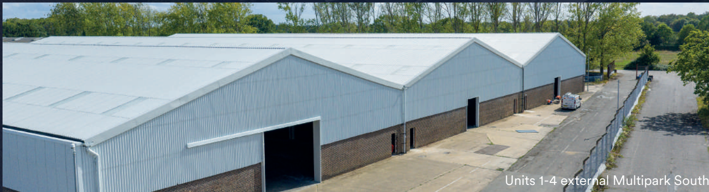
Units 1-4 external Multipark South