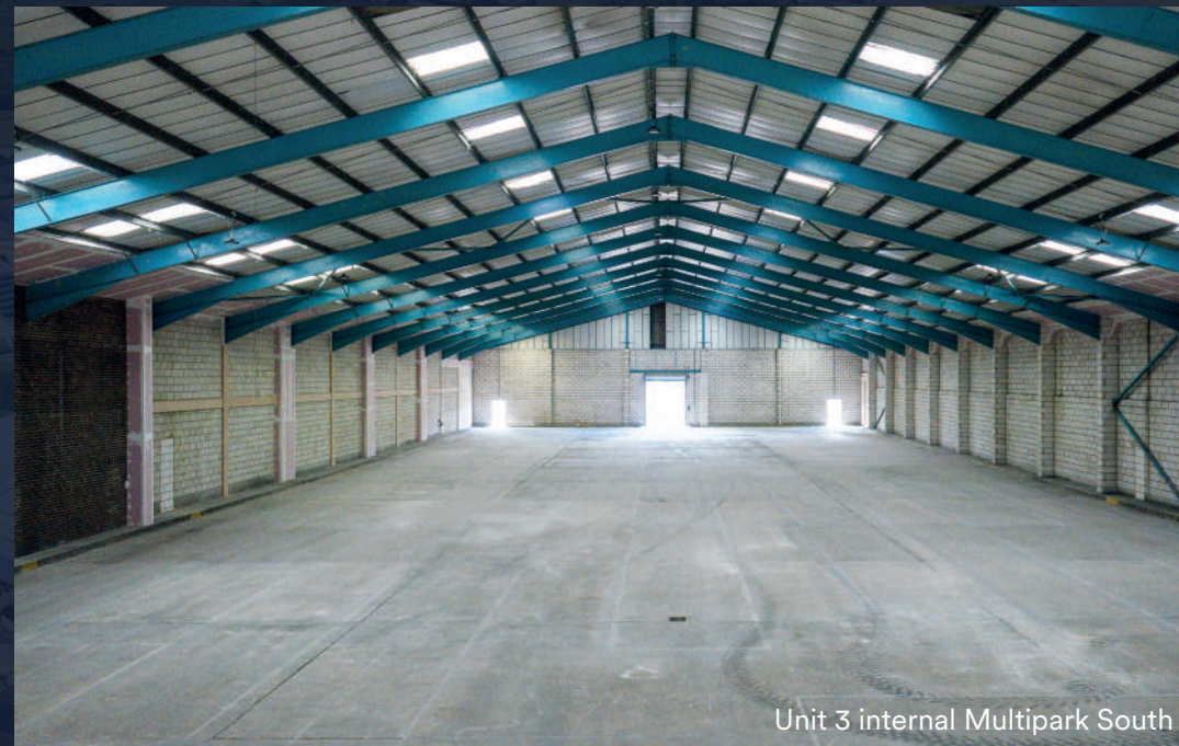
Unit 3 internal Multipark South

Plots of 1 - 5 acres of concreted secure yard space are available by separate negotiation.