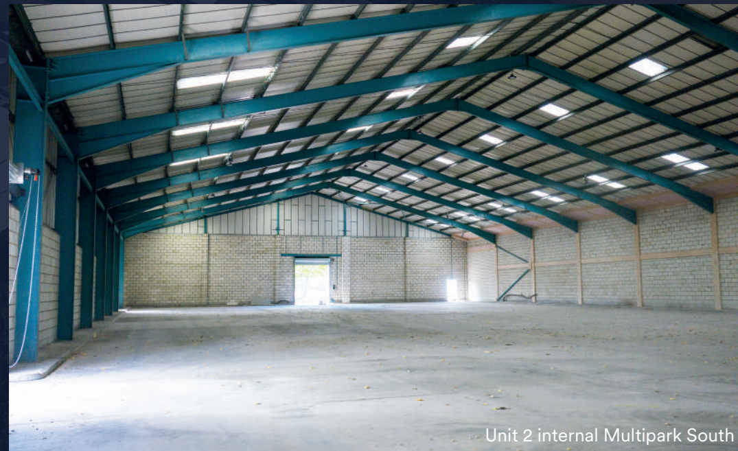
Unit 2 internal Multipark South