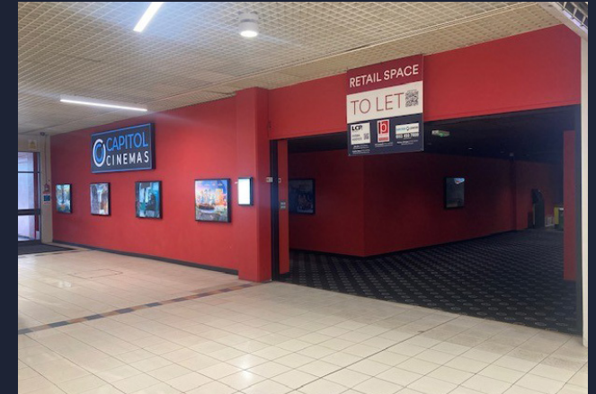
Unit 77 & 79